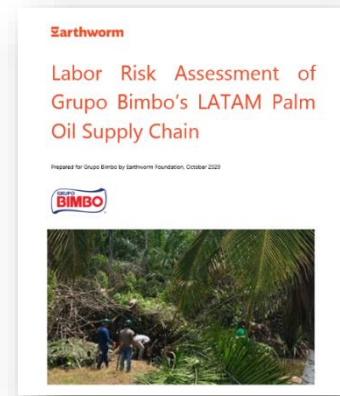
Figure 3: Labor risk Assessment report in palm oil supply chain in LATAM

In 2019, a materiality assessment was carried out in the agricultural supply chain, including palm oil. In Latin America, palm oil labor issues were one of the most material issues along with deforestation. In response, Grupo Bimbo has prepared an analysis on the occupational risk in its palm oil supply chain in Latin America and based on this analysis it is evaluating an intervention in its supply chain.