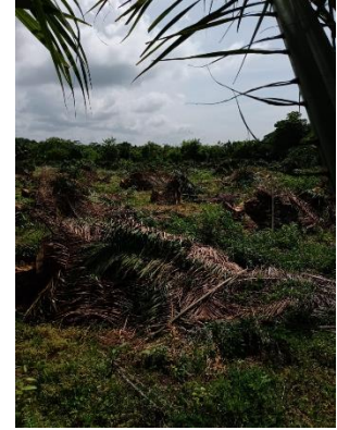
Figure 3: Transformation projects in Chiapas. 2020.